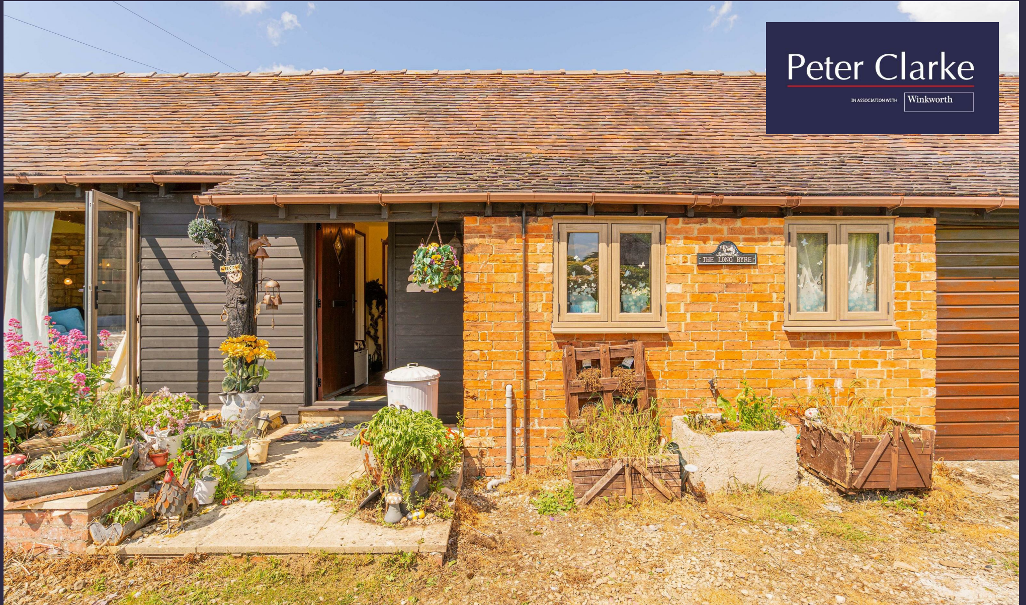
The Long Byre Pillerton Hersey, Pillerton Hersey, Warwick, CV35 0QA